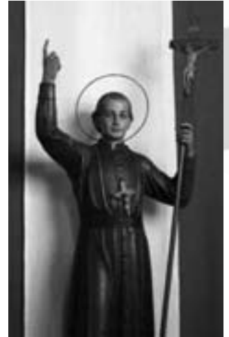
St. Gaspar del Bufalo, the founder of the Missionaries of the Precious Blood

The Saint Gaspar Society recognizes individuals who have put in place a gift that will benefit Saint Joseph's College in the future rather than immediately. These gifts are called "planned gifts" or "deferred gifts." Your estate plan might include a will bequest, an IRA beneficiary designation, a trust provision, or a life insurance policy designation with Saint Joseph's College named as a partial or complete beneficiary.