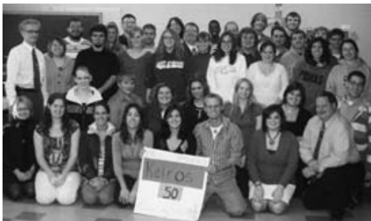
Kairos L retreatants and leaders

Going strong since 1986, Kairos is now offered three times a year for SJC students, and given its reputation it is easy to see that it will remain a part of the SJC experience for years to come.