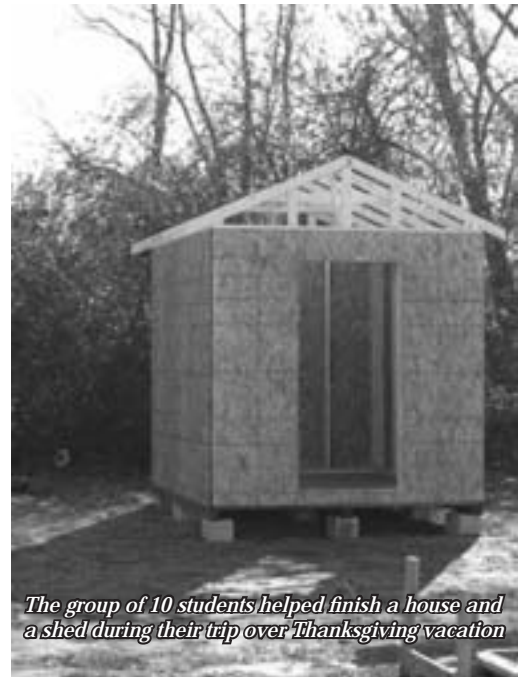
The group of 10 students helped finish a house and a shed during their trip over Thanksgiving vacation