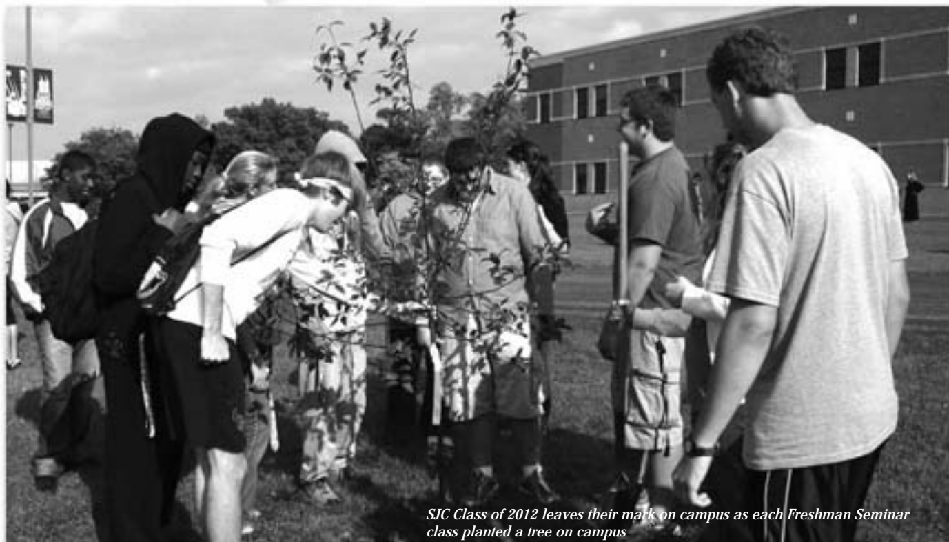
SJC Class of 2012 leaves their mark on campus as each Freshman Seminar class planted a tree on campus