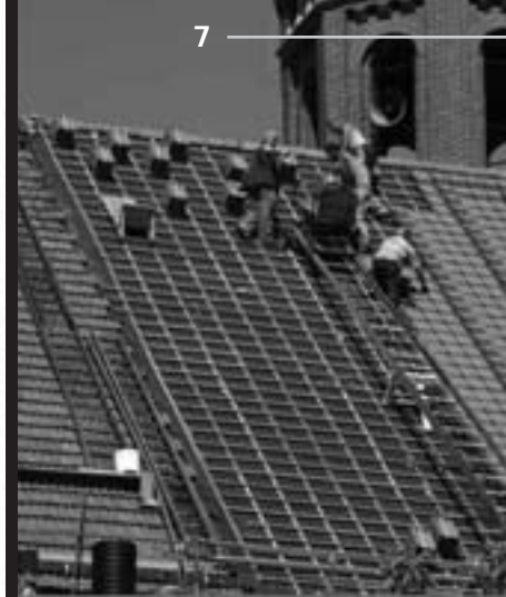
A new roof was constructed on the Chapel in the summers of 2005 and 2006

For more information, please visit alumni.saintjoe.edu