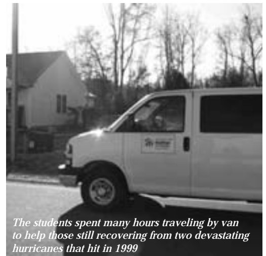
The students spent many hours traveling by van to help those still recovering from two devastating hurricanes that hit in 1999