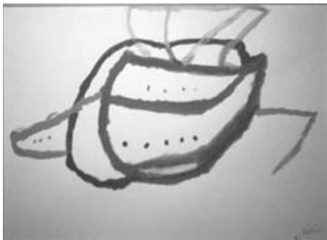
A painting by Zier's student named Helen titled "Spider Plant"