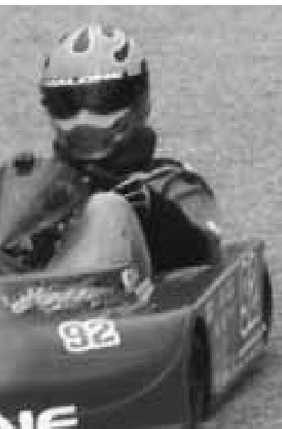
is way to his second Little 500 victory

Little 500 will be on Saturday, April 18, 2009.